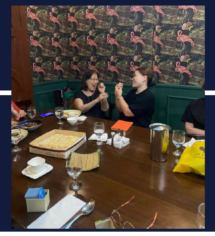
FUN, FUN, FUN.

It was a fantastic fellowship night at the Rotary Club of Cebu Gloria Maris themed meeting!